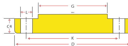
TYPE 05 BLIND FLANGES